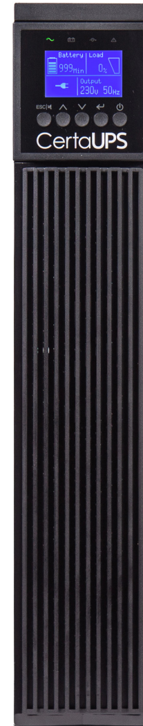
*Image shows 6KVA C650R UPS